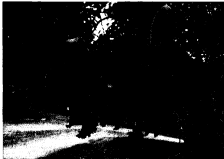
From my garden at Paradeisos